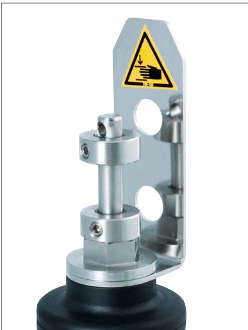
Stainless steel holder for proximity switches